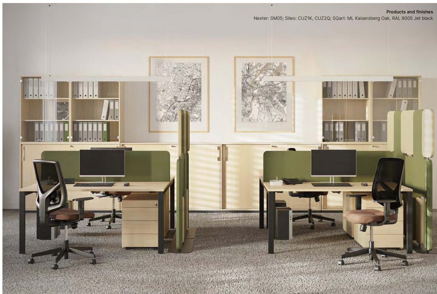
Products and finishes Nexter: SM05; Sileo: CUZ1K, CUZ2Q; SQart: ML Kaisersberg Oak, RAL 9005 Jet black